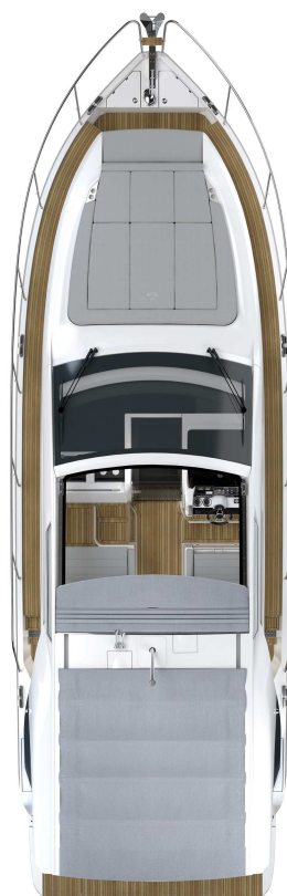
MAIN DECK Option with soft-top