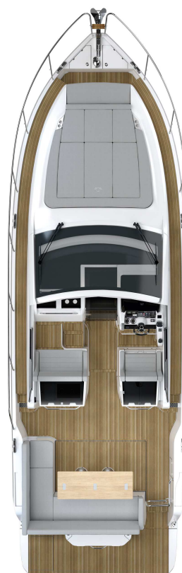
MAIN DECK Option with barbecue at stern, long platform and fixed cockpit table