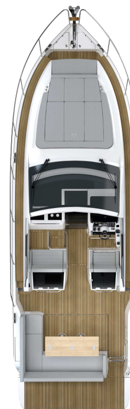
MAIN DECK Option with cockpit table to be transformed into sunpad and extended bathing platform