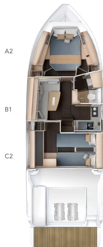
LOWER DECK Option galley with gas stove and gas oven