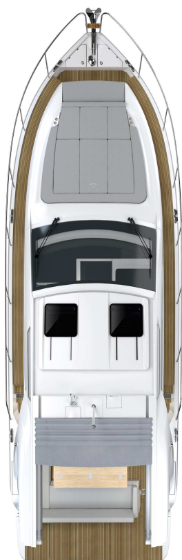
MAIN DECK Standard